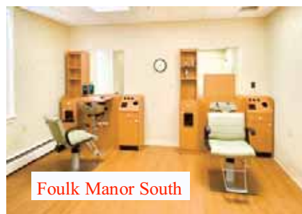
Foulk Manor South