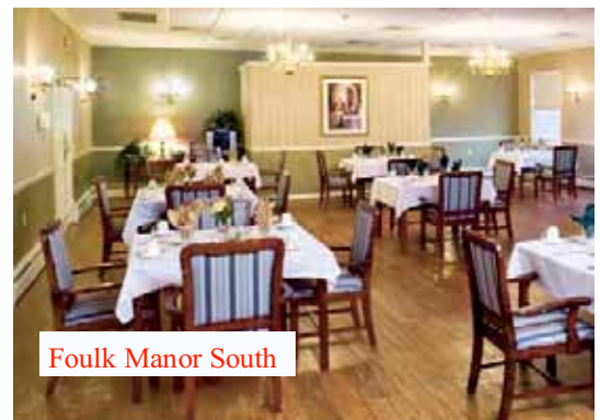
Foulk Manor South